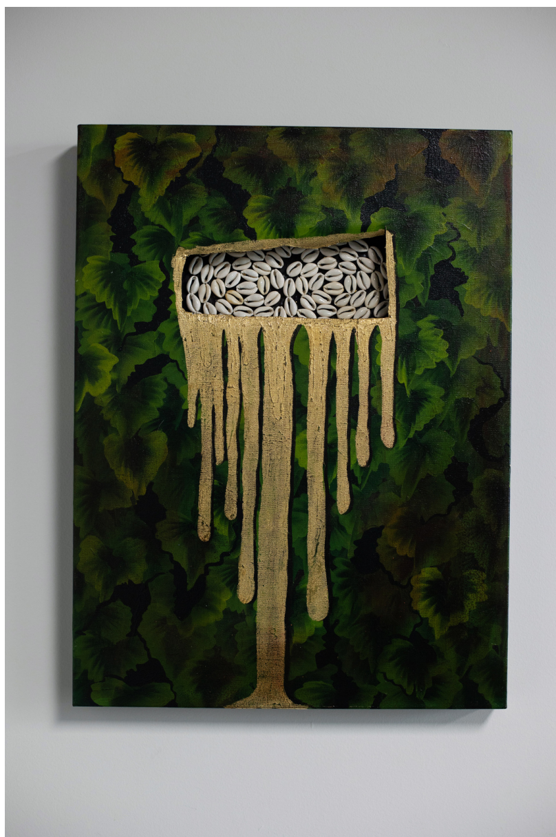
ABI SALAMI "AND WE FOUND GOLD" 18X24 2023 $3,000. MIXED MEDIA ON CANVAS