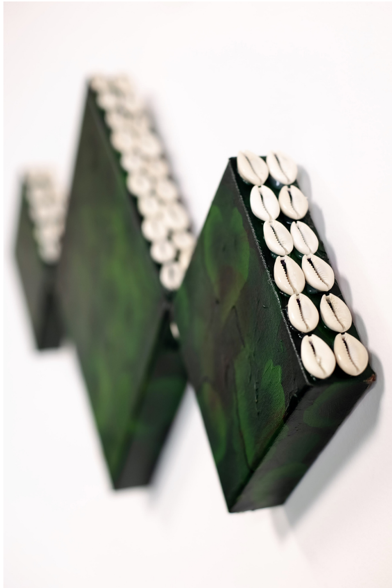
ABI SALAMI "CARBON TEARS #1" (DETAIL VIEW) 31X13 2023 $2,500. MIXED MEDIA ON CANVAS