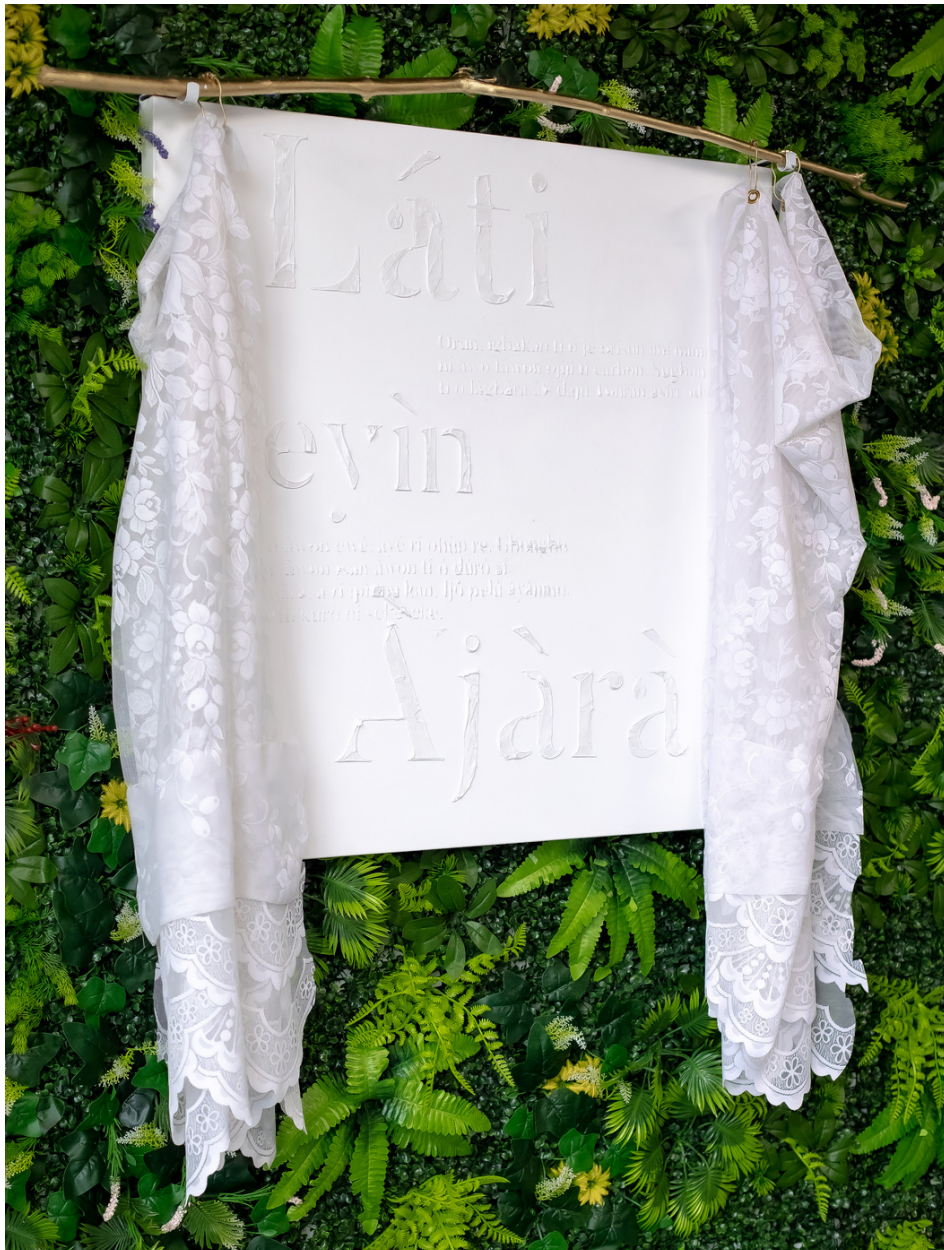
ABI SALAMI "LÁTI LEYIN AJARÀ" 48X48 2023 $9,500. MIXED MEDIA & ACRYLIC ON CANVAS