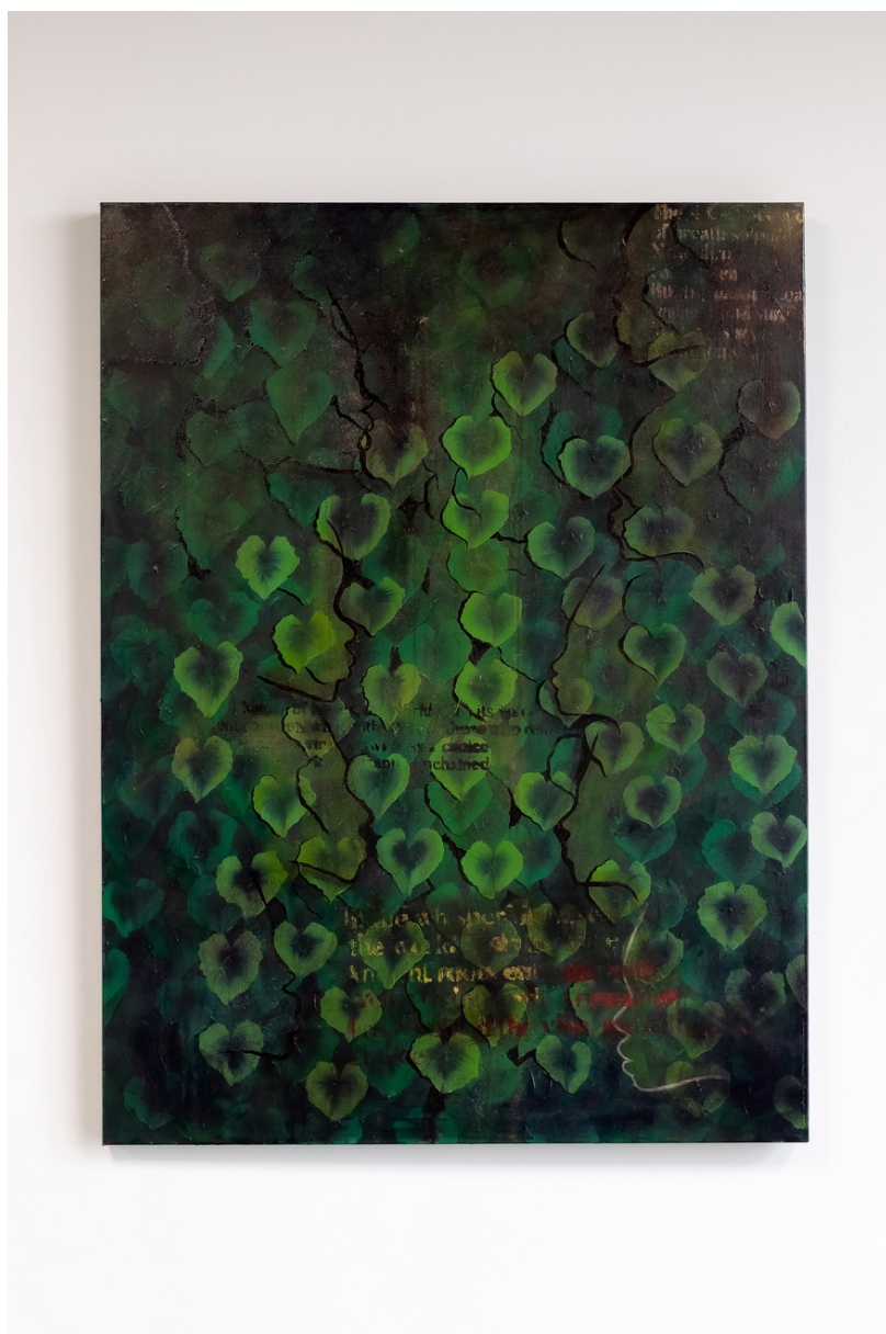
ABI SALAMI "THE LEVELING'S NIGHT" 36X48 2023 $7,200. MIXED MEDIA ON CANVAS