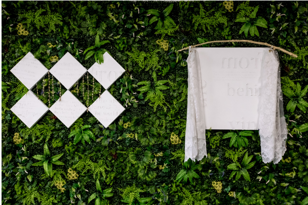
ABI SALAMI "FROM BEHIND THE VINE" 2023