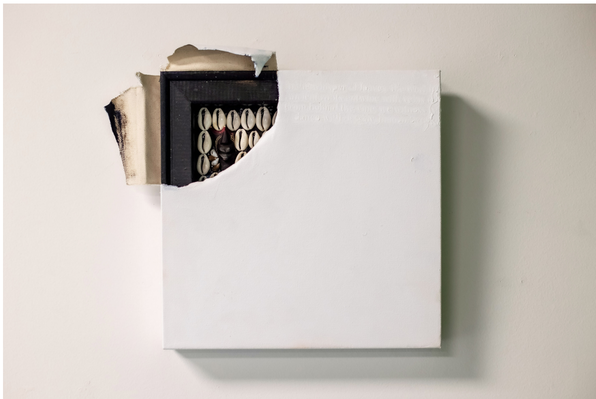
ABI SALAMI "A DISCOVERY" (STUDY) 12X12 2023 $1,000. MIXED MEDIA ON CANVAS