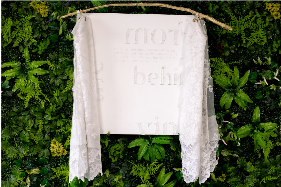
ABI SALAMI "FROM BEHIND THE VINE" 48X48 2023 $9,500. MIXED MEDIA & ACRYLIC ON CANVAS