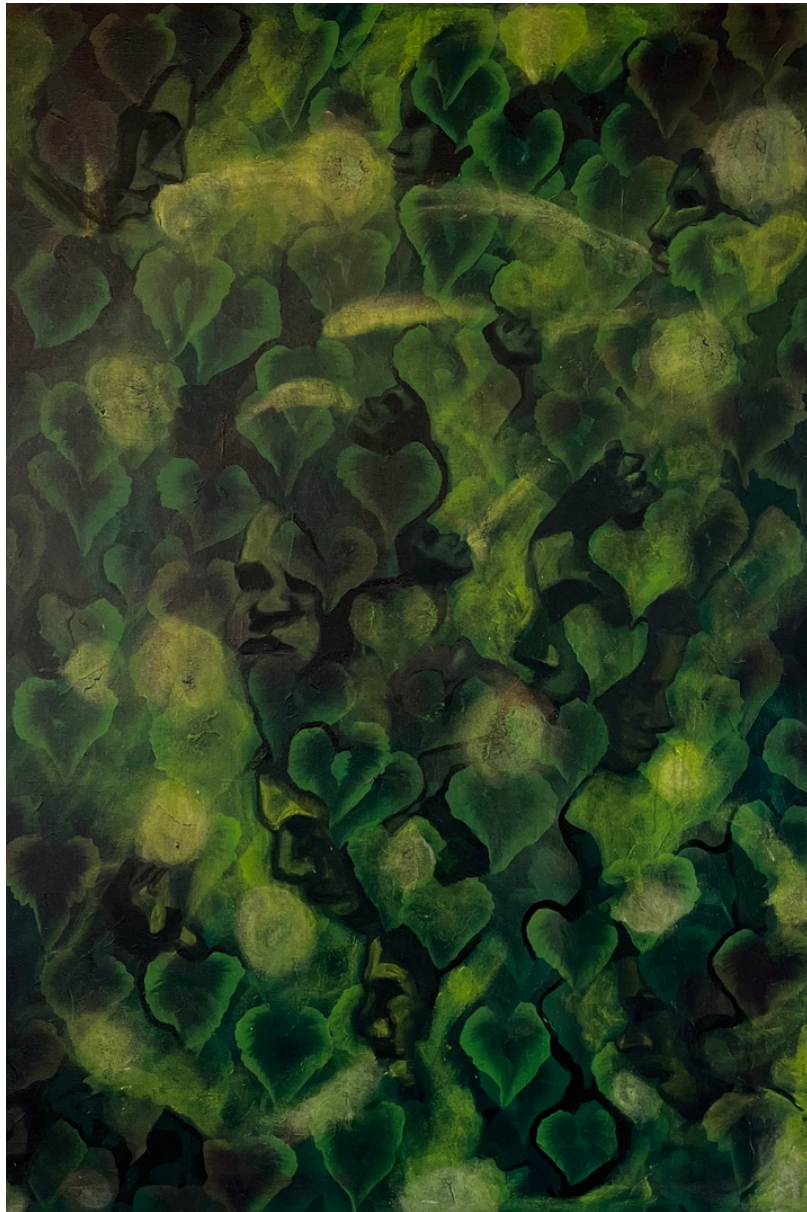
ABI SALAMI "THE WORDS & LIGHT OF THE ANCESTORS" 36X48 2023 $7,200. MIXED MEDIA ON CANVAS