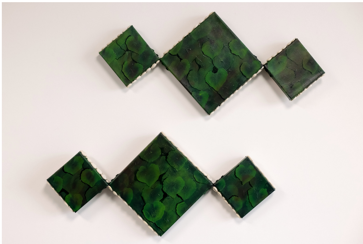
ABI SALAMI "CARBON TEARS #1" & "CARBON TEARS #2" 31X13 2023 $2,500. (EACH) MIXED MEDIA ON CANVAS